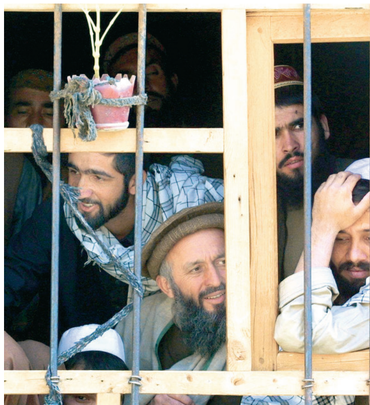
▲ Captured Taliban fighters look out from a jail cell near the Afghani capital of Kabul.

The challenge before Afghanistan, however, is neither unique nor new. As you will read in the next chapter, over the past 50 years countries around the world have attempted to shed their old and often repressive forms of rule and implement a more democratic style of government.